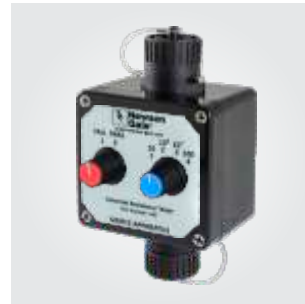
Universal Resistance Tester Product Code: URT.