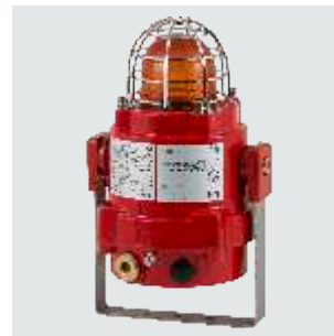
Ex Strobe Light Product Code: STROBE11/A (Amber strobe). Please enquire for options