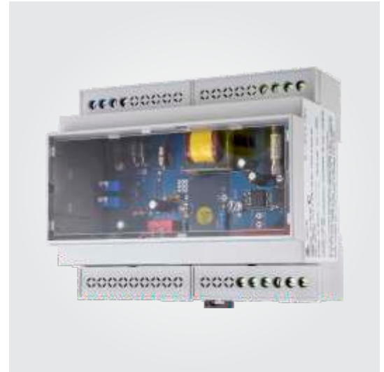
Earth-Rite OMEGA II

Two volt free changeover contacts can be used to switch power to additional ground status indicators or interlock with the process to shutdown product transfer when the OMEGA II detects an open circuit on the path to ground.